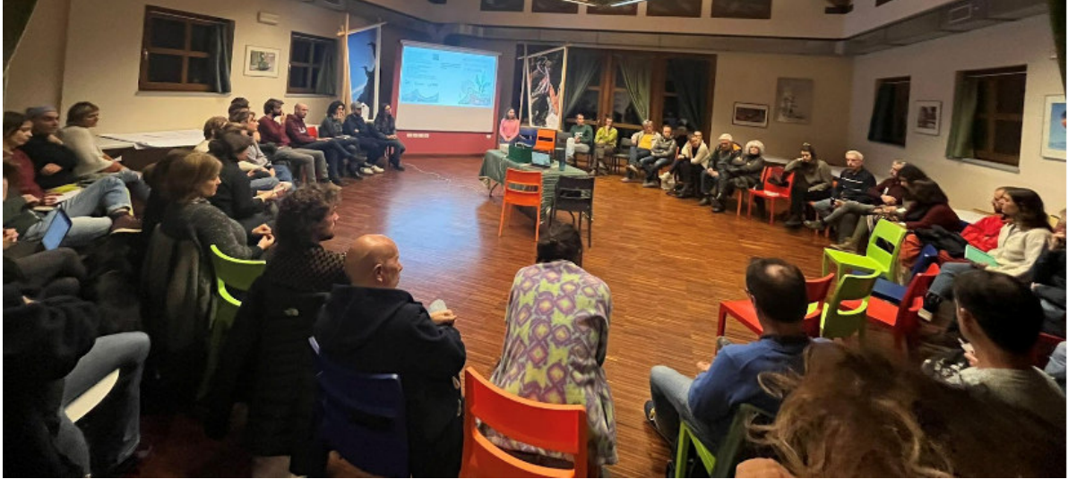
Education activity of the 3rd Workshop in the Italian living lab.