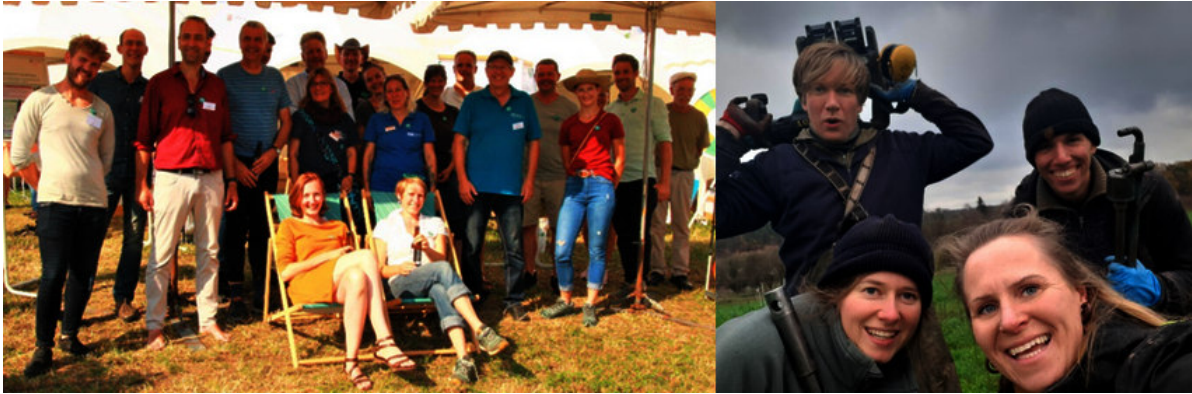
PFN-Team for Agroecology.