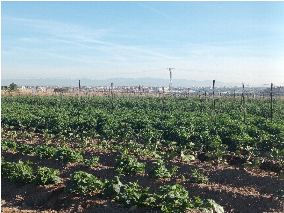
The experimental farm with the region of Madrid in the background.