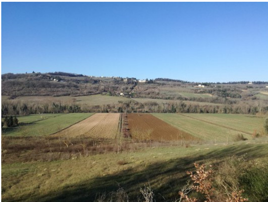
Overview of the Montepaldi Long-Term Experiment (MoLTE) at the Montepaldi farm (San Casciano Val di Pesa, Italy).